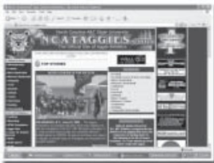
Up-to-the Minute Information Stats - BiosNotes, Previews - Press Releases - Exclusive Stories - Photo Galleries